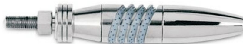
▲57873 | Rings 4/2 | Synthetic For delicate fabrics and ties. VAMATEX