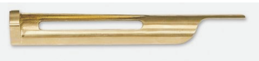
▲57696 LH - RH Dyna Terry Temple cover.