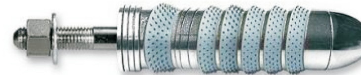
▲57801 | Rings 1/5+5/4 | Synthetic For delicate fabrics, ties and strong seal in selvedge VAMATEX