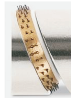
▲57454 Unit for selvage Leno device.