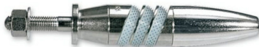
▲57474 | Rings 3/4 | Synthetic For very delicate fabrics and ties.

Ambica Industrial Estate, Nr. Kothari Char Rasta, Rakanpur-Santej, Tal. : Kalol, Dist. : Gandhinagar - 382721. Gujarat, India. Telefax : 0091-79-29299464, M. : 09898807690, +919429197767 E-mail : dmtc_ahd@hotmail.com , info@dmtcindia.com Website : www.dmtcindia.com