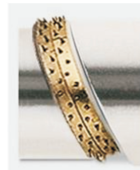
▲57454 A VAMATEX