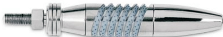
▲57866 | Rings 6/2 | Synthetic For delicate fabrics and ties.